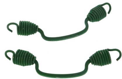
OFFSET RETURN SPRING (MERITOR PART 2258Y1273)